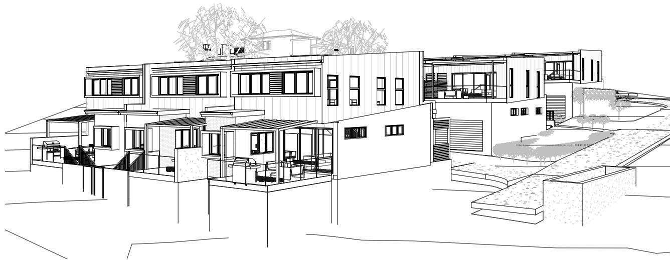
3D PERSPECTIVE 1