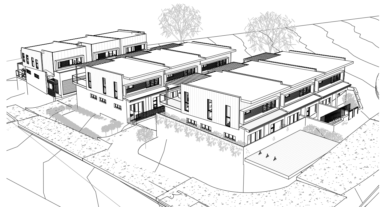
3D PERSPECTIVE 4