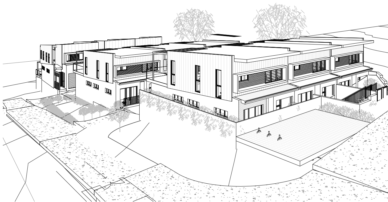
3D PERSPECTIVE 3